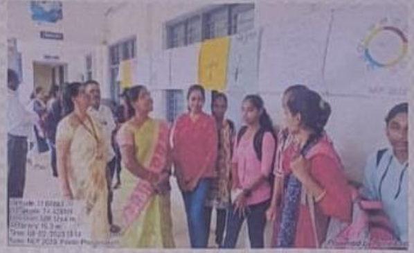
Poster presentation by B.Sc. III & I Students