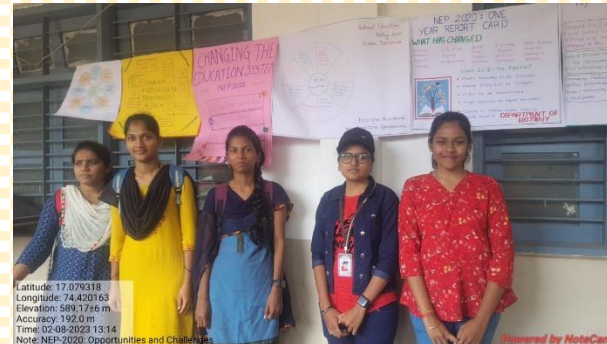
Poster presentation by B.Sc. III & I Students